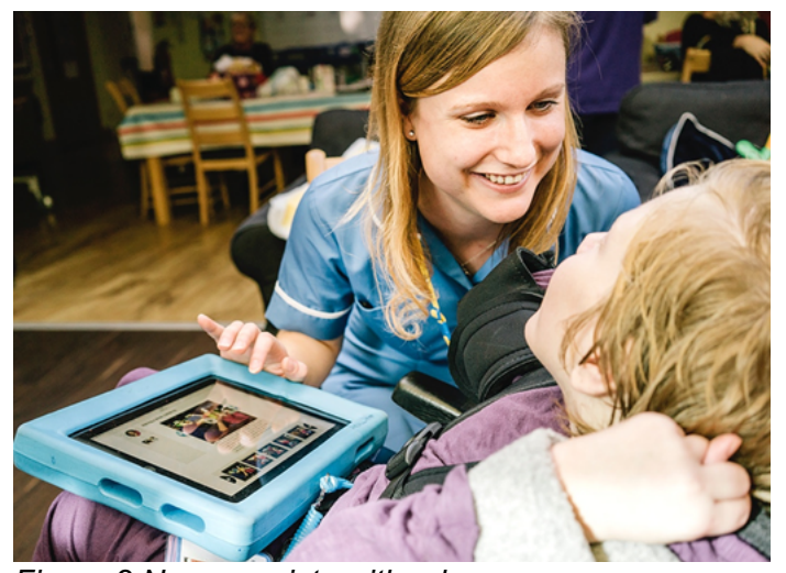
Figure 2 Nurse assists with advocacy

People with LD are structurally disadvantaged in terms of their human rights. In 2001, the Valuing People report noted poor community-based service provision and planning processes at key transitions, lack of choice and control over their own lives, unmet health-care needs, limited housing and employment opportunities, and significant digital exclusion.