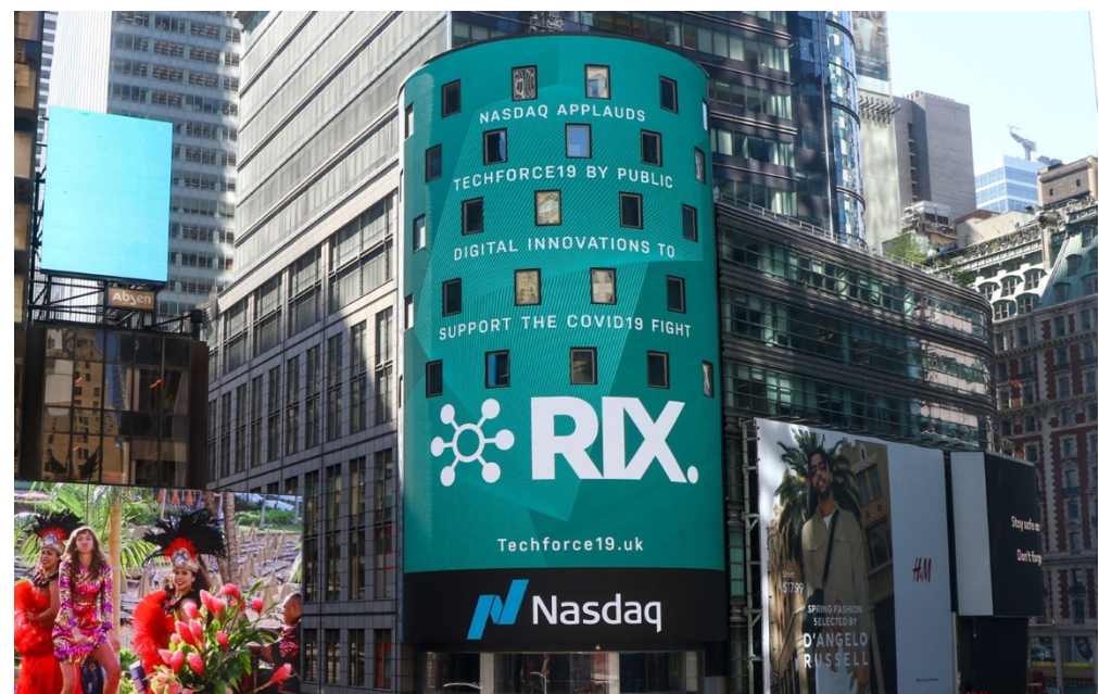
Figure 3 RIX in Times Square, New York

Minnion's action research has resulted in 20,000 annual RIX Wiki accounts for use with adults, with training and consultancy across 20 UK local authorities, NHS services and social care providers. 6,019 professionals and parent/carers have completed training over this period, with 75% provided via face-to-face provision. This work has transformed traditional care and support practices, pioneering use of digital person-centred tools for the first time for 88% of trainee participants. This has driven culture-change for organisations struggling to adopt personalised care provision over legacy paper-based processes that interpreted assessment as a one-off service-led process that failed to engage effectively with the voice of young people and their carers. Use of RIX software positively engages parents and carers ($7), which local authorities report has helped reduce adversarial meetings and costly tribunals, saving public-costs.